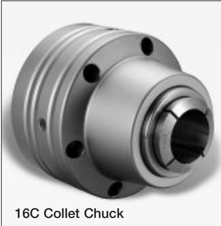
16C Collet Chuck