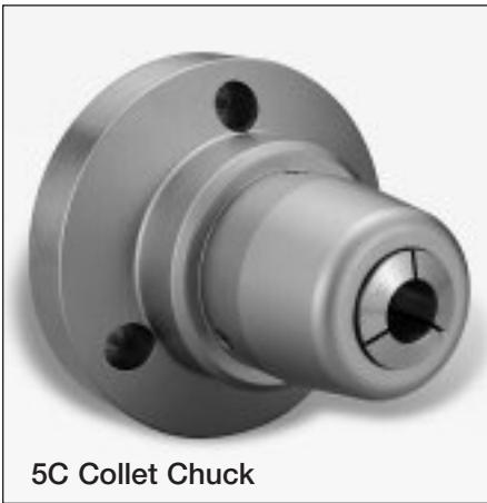
5C Collet Chuck