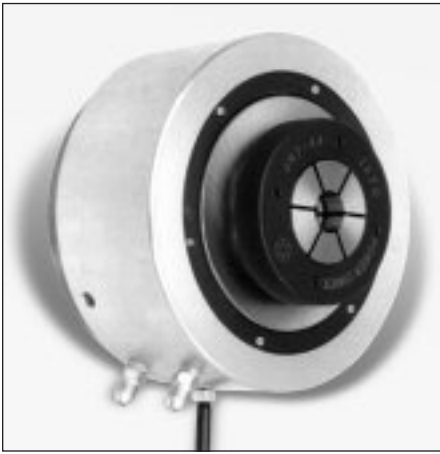
Collet Type Rotary Power Chuck