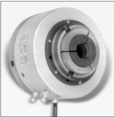
Jaw Pad Type Rotary Power Chuck