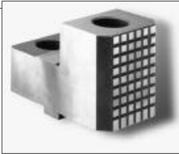
One Step Top Jaw