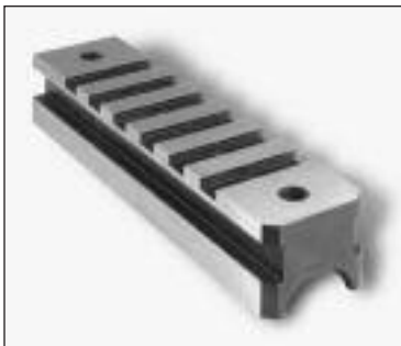
Optional Long Base Jaw